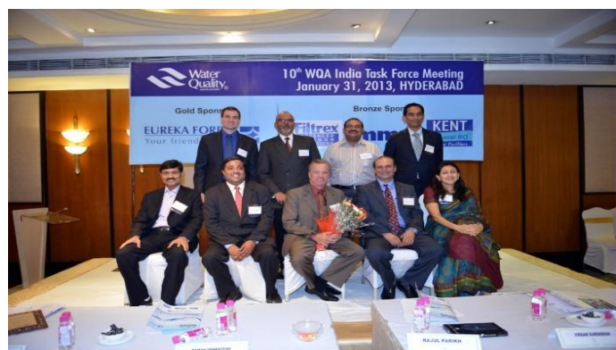
10 th WQA India Task Force Meeting held on January 31 st , 2013, in Hyderabad